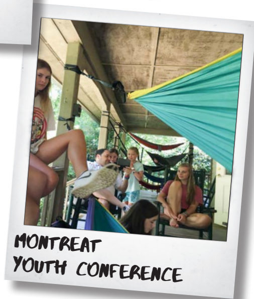
MONTREAT YOUTH CONFERENCE