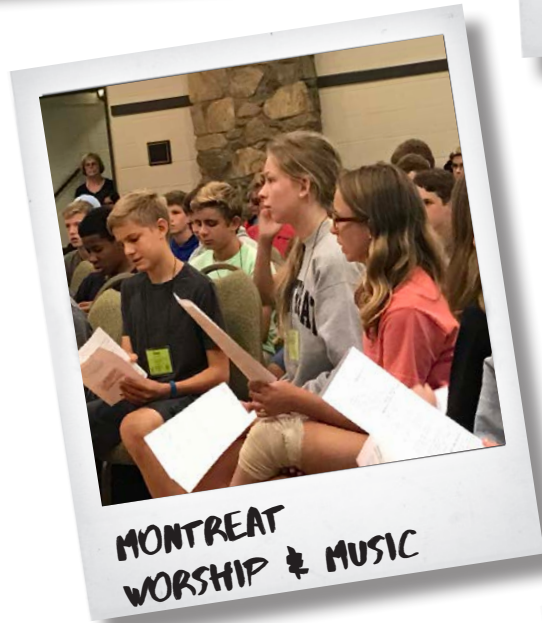
MONTREAT WORSHIP & MUSIC