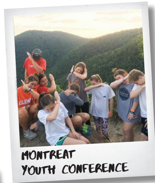
MONTREAT YOUTH CONFERENCE