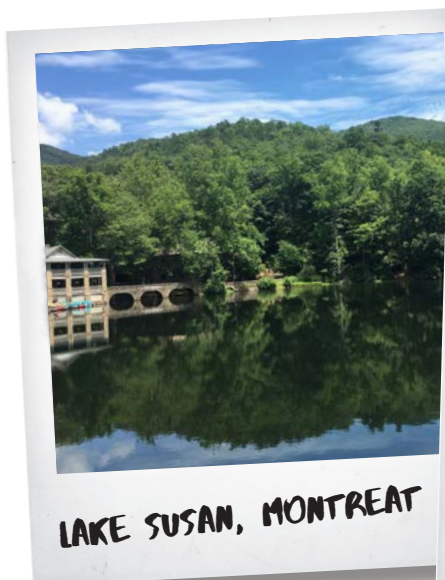
LAKE SUSAN, MONTREAT

Required Trip Meeting (for the student participating and one parent): 12:15 p.m., April 15, 2018