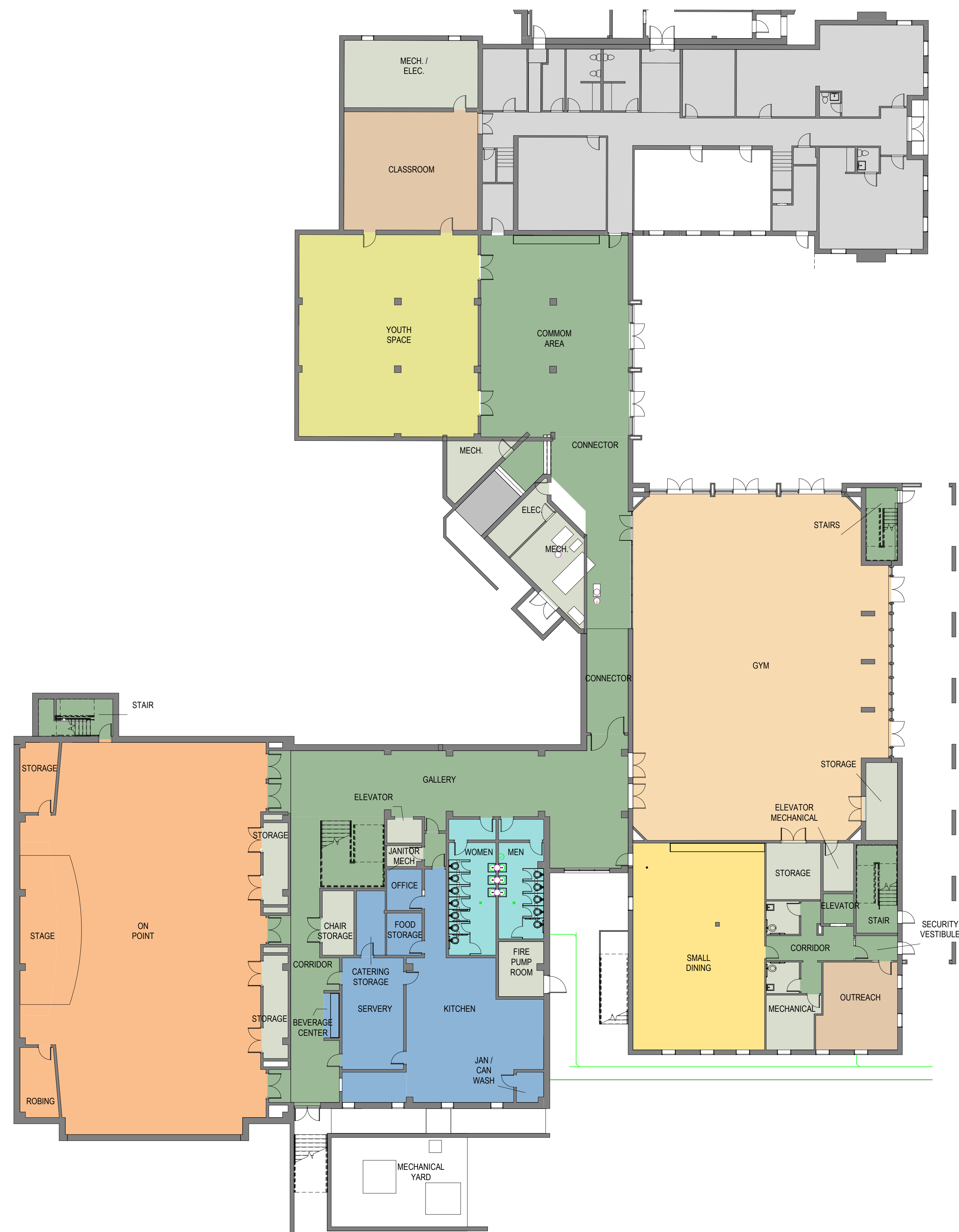
FIRST FLOOR 1/16" = 1'-0"